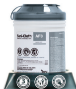
Sani-Canister Caddy ® for placement on flat surfaces (bilingual)