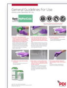
Educational Wall Charts and signage (bilingual)