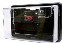
Softpack Wall Bracket allows for convenient access